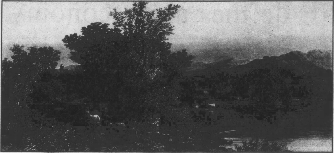
"The Housatonic River" (1872-74), a steel engraving by A.F. Bellows in "Picturesque America, or The Land We Live In," a book edited by William Cullen Bryant.